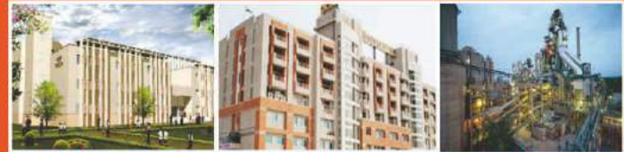
Raffles International School